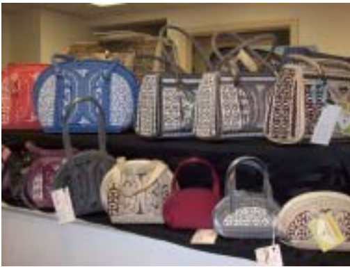
Laga bags on display

On September 13 we held our 2 nd Laga Handbag sale. The Community Help Centre and Aids Project generously donated their space so we could hold the sale downtown.