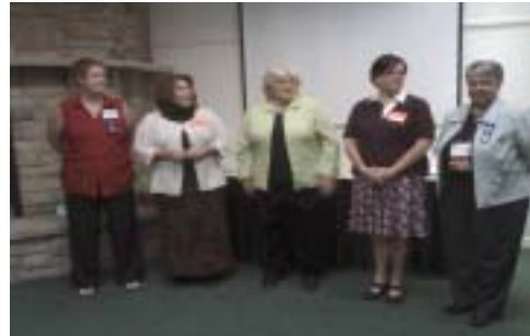
Our new members and their sponsors